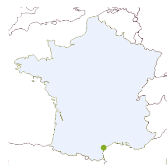
Variety experimentation location

Resistance level : + = moderate resistance ; ++ = good resistance ; +++ = very good resistance